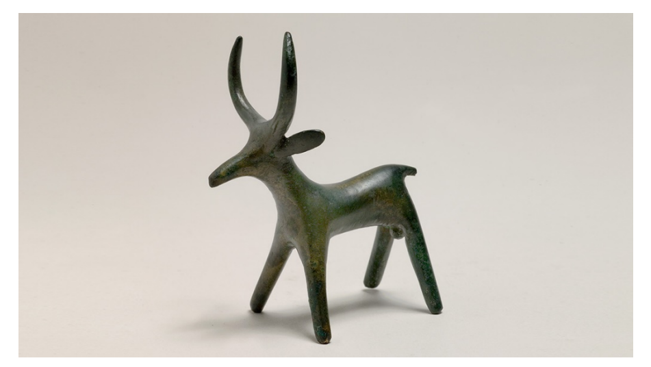
Small bronze statue of a bull, Hallstatt period (7th/6th century BC), Hallstatt, Upper Austria.

The Late Bronze Age culture in question bears the name "Hallstatt" after the lakeside village in the Austrian Salzkammergut southeast of Salzburg, where there was a rich salt mine, and where some 1,300 burials are known, many with fine artifacts like this bronze bull now in the GNM Nuremberg.